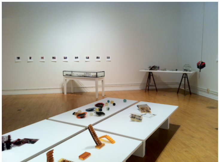
Installation view, Paul Robeson Gallery, Newark, NJ