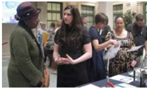
conferences & meetings